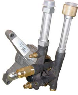
Figure 1 - SRMW

This plunger pump will pump up to 2.2 GPM at 2600 PSI. It spins at 3400 RPM in a direct drive system coupled with a gasoline engine. The matching flange provides convenient connection to most 7/8" shaft 1.1 - 5.5 HP engines. The hollow shafted pump includes a built-in pressure control valve, and chemical injection system.